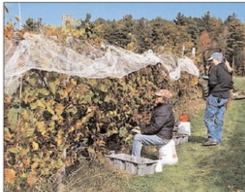
Walpole Mountain View Winery won the 2012 Farm of Distinction Award.

To be nominated, a farm must be commercial, have proper signage and the view of the farm as seen from a public