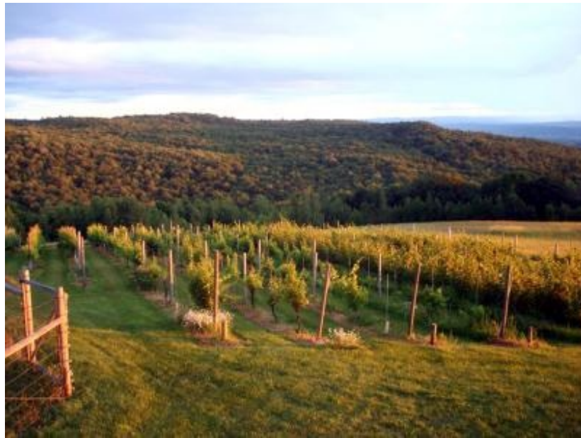
Walpole Mountain View Winery Vineyards overlooking the Connecticut River Valley

Submitted by VT Journal on Wed, 03/07/2012 - 10:24am